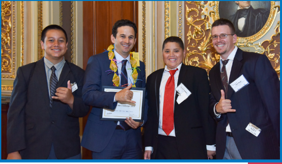
Senator Brian Schatz (D-HI) with winning students from Chiefess Kamakahelei Middle School, Hawaii