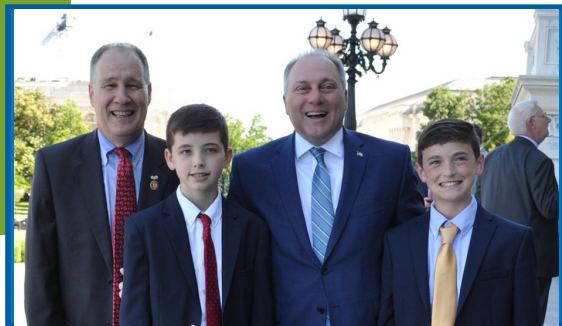
First place students from Milam Elementary School, Mississippi meet Representative Trent Kelly (R-MS) and Representative Steve Scalise (R-LA) on the steps of the Capitol.