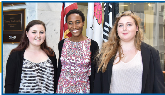
Winning students from Red Hill Jr/Sr High School, Illinois visit the office of Senator Tammy Duckworth (D-IL).