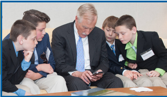
Winning students from Maine strategize with Senator Angus King (I-ME)