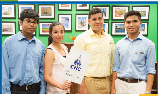
Winning students from Connecticut visit Representative Jim Himes (D-CT)