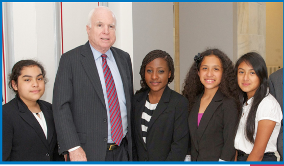
Senator John McCain (R-AZ) with winning students from South Central Middle School

THE VALUE The Capitol Hill Challenge helps students better understand the global economy, develop personal financial skills, and improve their knowledge of math, economics, and business. CHC also provides Members of Congress an opportunity to connect to schools in their districts, and to inspire and serve as role models for the students.